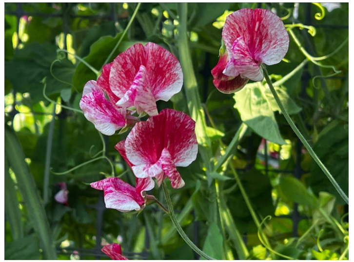
3. Always save your sweet pea seeds – you often have a nice surprise!

Autumn is the ideal month for planting in districts with hot, cloudless summers. While our last three summers were warm and wet, we all know that's not likely to last.