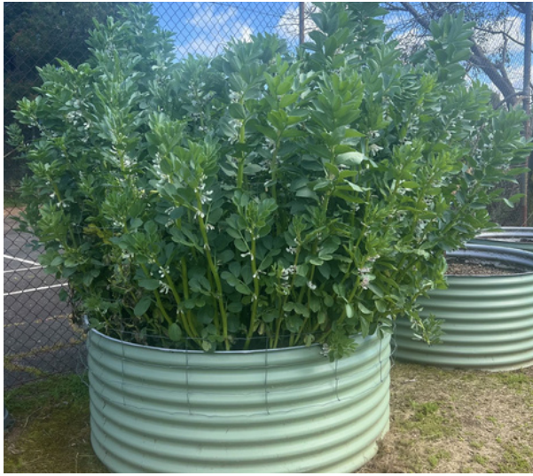
2. Broad beans can be sown now to harvest next October.

Autumn propagation includes sowing. Broad beans can be sown around the equinox (21st March). Sow quick growing sugar snap peas now to snip all winter to flavour soups and salads. Sweet peas sown now will race away next spring and flower in early summer.