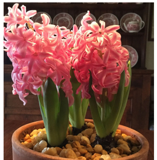
4. Plant hyacinth bulbs now and put into a dark corner to flower indoors in midwinter. Remember to keep them damp

Finally, plant a few hyacinths now for lovely colour and scent in the kitchen in July.