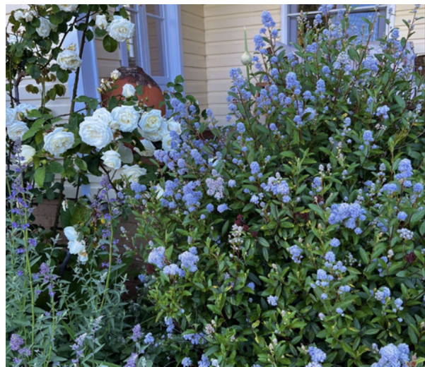
1. Deciduous ceanothus 'Gloire de Versailles' flowers for many months during summer.

Although it can reach 5 metres it's easily tamed with an annual cut, and being virtually drought proof it makes a beautiful hedge.