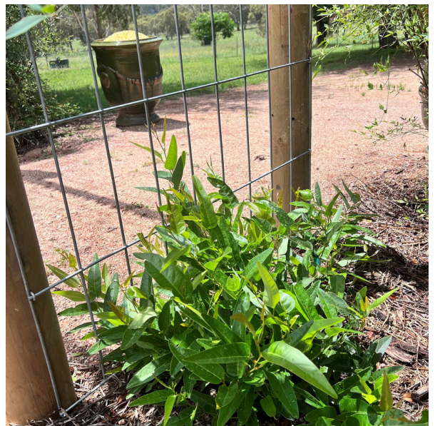
Hardenbergia Happy Wanderer planted in October has already put on good growth.

Naturally I was sentimentally attachment to our old pergolas - like many gardeners I'm innately conservative about the garden - and strenuously resisted any change. But I was wrong: I love the new ones, which were finished just in time, and I'm enjoying watching two new creepers, Clematis montana Starlight and Hardenbergia violacea Happy Wanderer beginning to climb them.