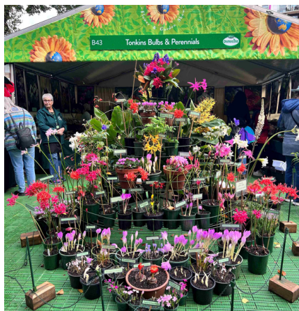
Eye catching pyramid of autumn bulbs by Tonkins Bulbs & Perennials.

We were greeted by streaming rain, well this is Melbourne folks, and the pervasive fragrance of thousands of hyacinths and tulips, forced into unseasonal flower. My favourite bulb stand though was specialist supplier Tonkins Bulbs & Perennials whose eye-catching pyramid of autumn bulbs were blooming in season. Nerines, lycoris, colchicums, tiny cyclamens: I need more autumn bulbs.