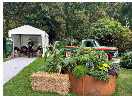
Vegetable displays among the show gardens and nursery stands.

Vegetable gardening's barrel continues to roll, evident everywhere in nursery stands and garden displays. I liked Vegepods' covered growing trays on mobile stands, handy for salad greens and herbs in a courtyard near the kitchen door.